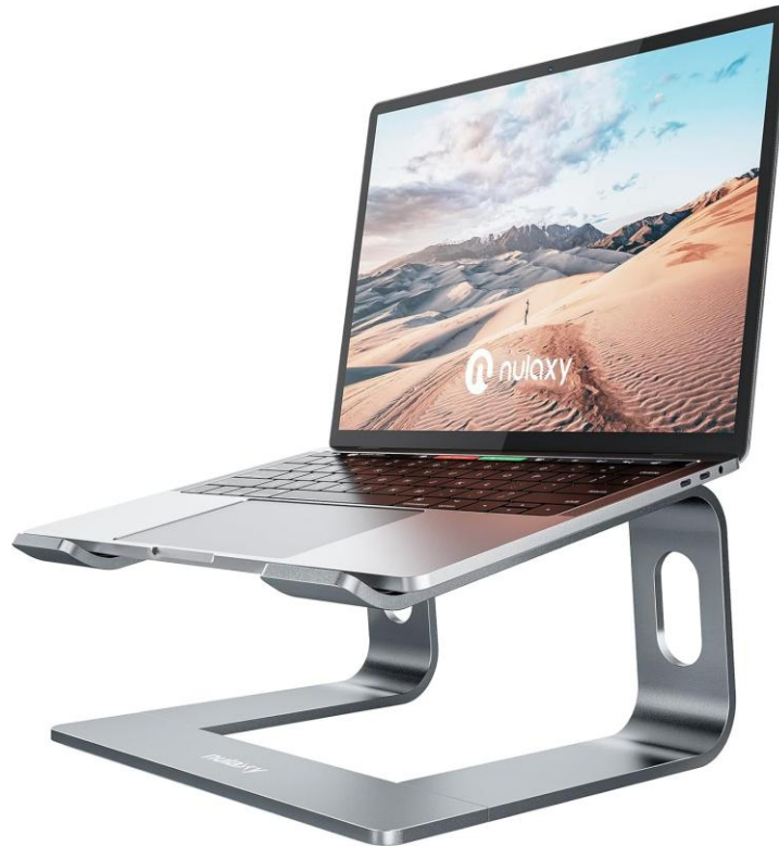
Nulaxy Laptop Stand