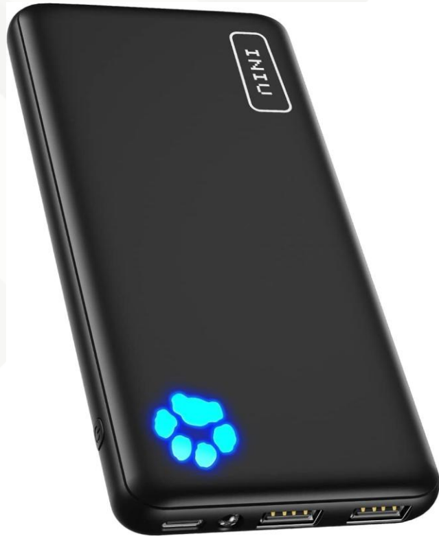
INIU Power Bank