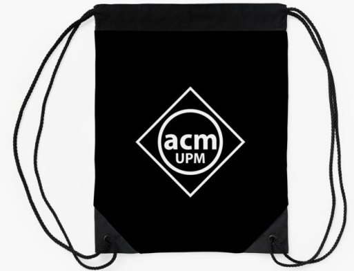
ACM Bag (Not accurate)